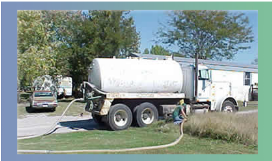
A licensed septic hauler can clean your tank.

The property owner is responsible for making sure the septic tank is properly installed and maintained.